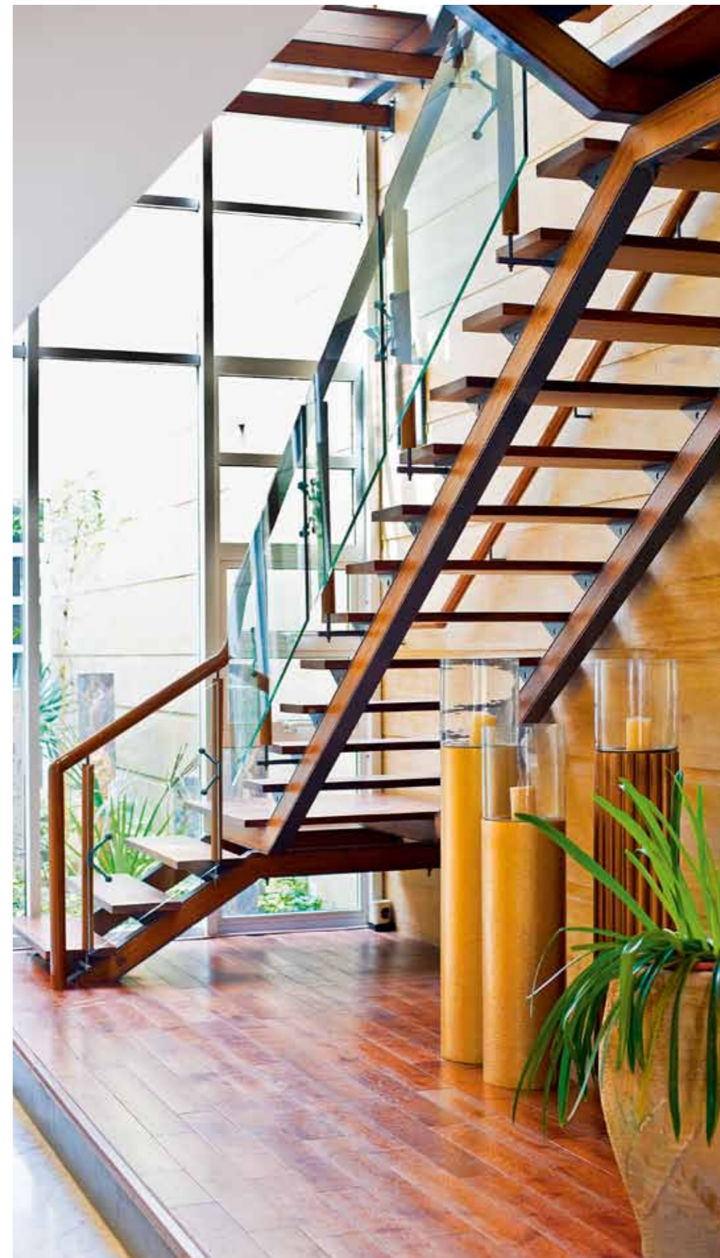
Left: The lobby allows accesses to the courtyard and the upper two floors. The sheesham-glass staircase has been mounted on a raised wooden platform to attract attention and blend it with the courtyard.

Panwar adds, "According to Indian Hindu tradition, a bathroom should not be above the prayer room and to avoid that, we extended the area to form a balcony."