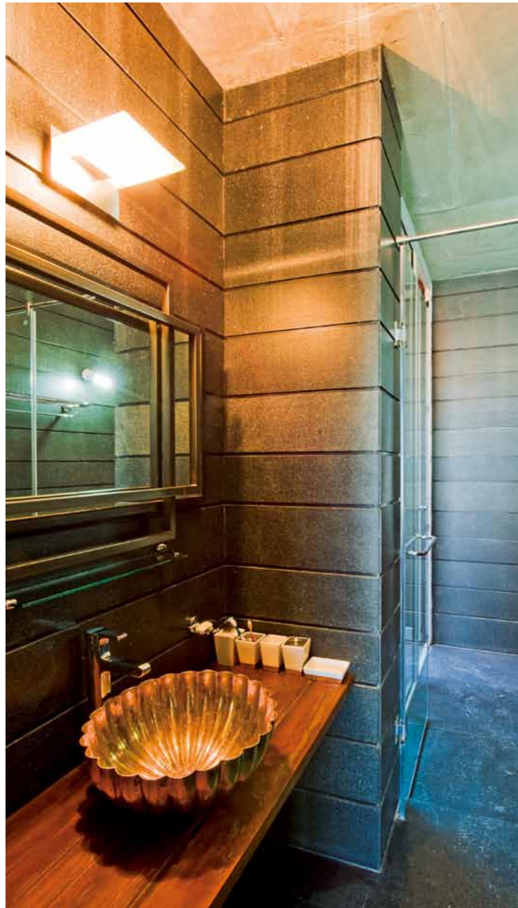
Right and facing page: A copper coated circular basin has been mounted on a wooden slab and provides additional storage. Wooden panels have been used on the shower stall walls as opposed to the black granite in the rest of the bathroom.