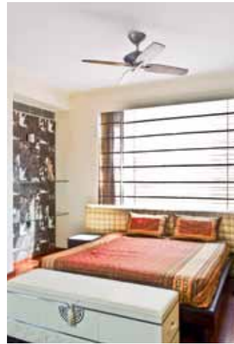
Above: The son's bedroom has fur leather wallpaper on one of the walls. The architect used dark coloured wallpaper as a contrast against the beige colour theme of the room.