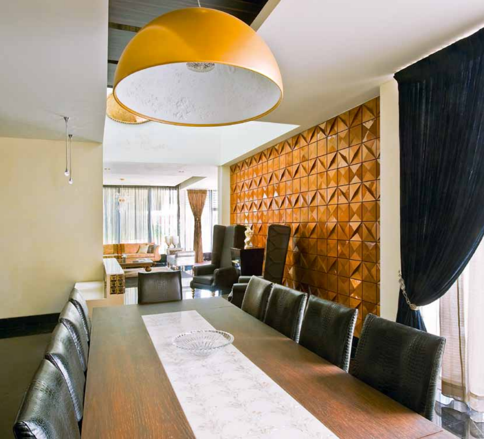
Above: The formal dining and the bar are at one end of the formal living room. In order to break the monotony of the white walls, the architect has used wood to create an unusual panel on the wall. Burma wood cutouts have been put together to create the triangular boxes on the wall. The black bar armchairs are from Alchemy.

the guest bedrooms has an open shower with wood paneled walls. The flooring is a combination of pebbles and exposed slabs.